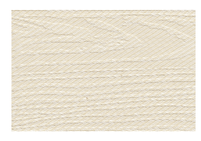
RICH CREAM SC-TB1-102