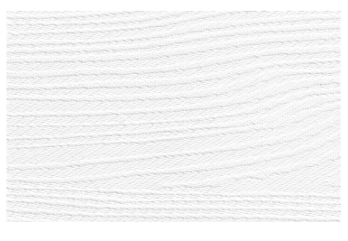
SILKY WHITE SC-TB1-101