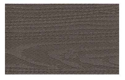
MILK CHOCOLATE SC-TB1-105